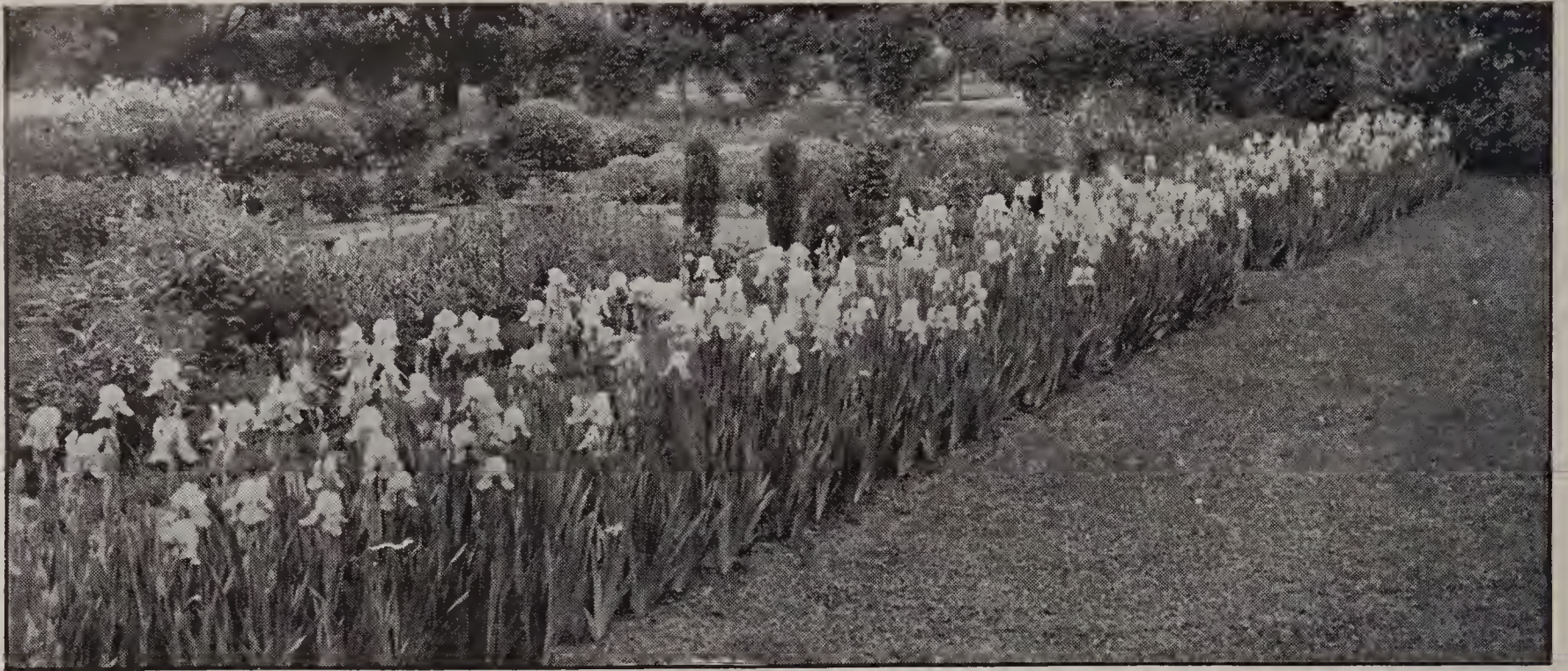
German Iris make a wonderful show of color in May and June